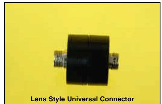
Lens Style Universal Connector