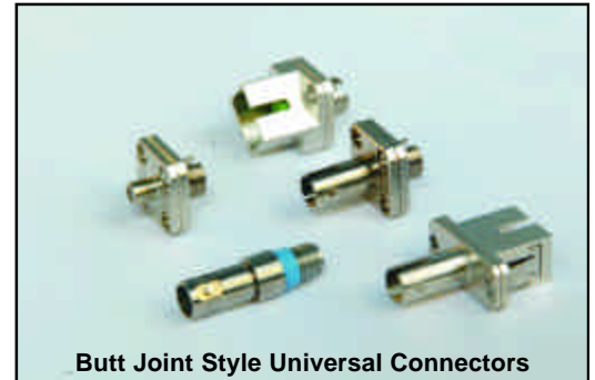
Butt Joint Style Universal Connectors

Please note that universal connectors will not couple light efficiently from a multimode fiber into a singlemode fiber. High losses are unavoidable in this situation, since multimode fibers have both larger numerical apertures and larger core sizes.