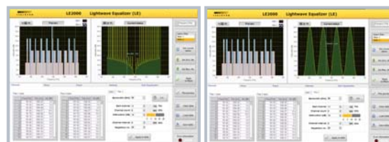
Graphic User Interface

* Above specifications are subjected to change without prior notice.