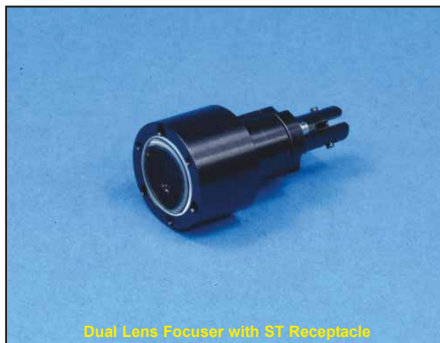
Dual Lens Focuser with ST Receptacle