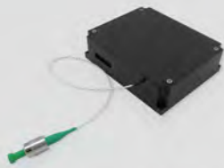
LiDAR Light Source