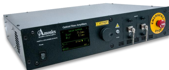
2U Rackmount Casing